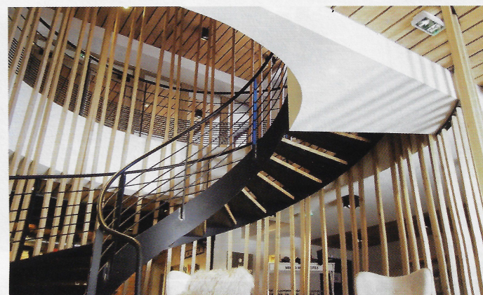
Grand Hôtel de Serre-Chevalier