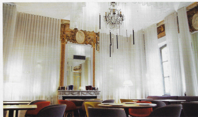
Château de la Pioline