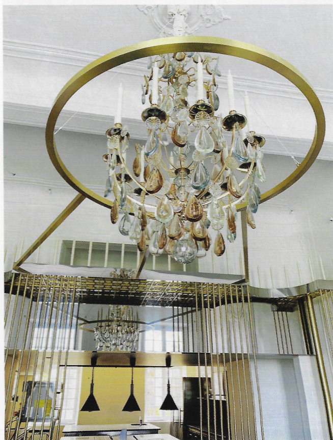
Château de la Gaude